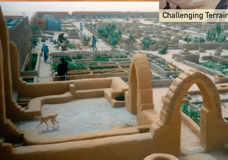
Crazy Project: a Garden in the Sand (1990)

BAREFOOT TO TIMBUKTU cleverly weaves archival and new material into a fascinating portrait of an out-of-the-ordinary Swiss/American swashbuckler.