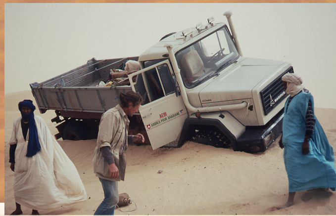
Challenging Terrain for Truck Driving in the Sahara (1990)

BAREFOOT TO TIMBUKTU cleverly weaves archival and new material into a fascinating portrait of an out-of-the-ordinary Swiss/American swashbuckler.